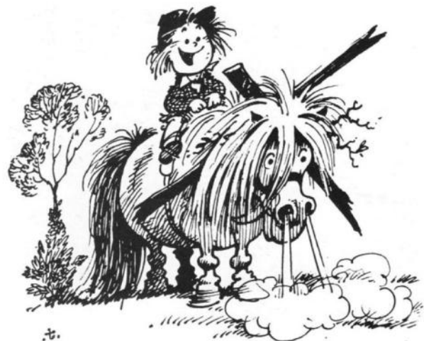
by Norman Thelwell; reproduced with kind permission from https://www.facebook.com/ThelwellNorman

It takes a village to round up the cows for milking these days. A canine village - a brawny but dopey hound, an overly-energetic border collie pup, a sweet but clueless foxy, and an overweight cranky chihuahua. What a sight. The poor cows don't know if they are being hunted, corralled or licked to death. - Caryn De Fazio