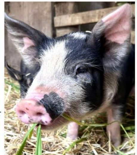
This is Beyonce